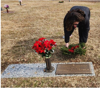
Governor Alexander Martin Society members participate in Wreaths Across America.