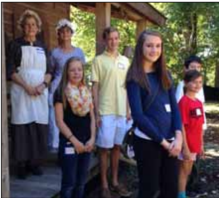
Joel Lane Society members at Peggy's Hearth & Garden in Franklinton, NC.

On Saturday, November 14th, several Joel Lane Society members and seniors took the short jaunt to Duke Homestead in Durham to attend the Winter Board Meeting. Afterwards the group had a picnic lunch outside and toured the Duke Homestead, grounds, and onsite museum. We learned that the Duke family grew and sold tobacco that was a crop the Native Americans introduced them to. While we know now that using tobacco is not good for your health, still the museum chronicles how North Carolina is at the heart of an international tobacco empire that was a main source of the State's wealth generation in the 1800