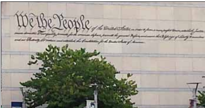
Outside of the building which houses the Liberty Bell.