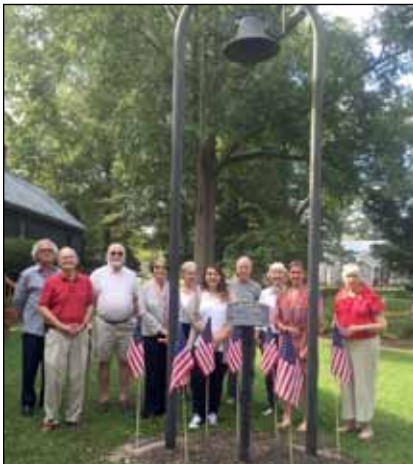
Major Benjamin May Chapter DAR, General George Washington Chapter SAR and Dr. Robert Williams Society C.A.R. on Constitution Day.