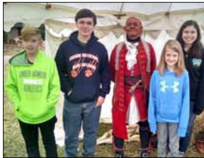
Rowan Resolves members with “Attakullakulla”

In October, the group braved the haunted streets of Downtown Salisbury, NC on the ghost walk tour. Salisbury has a rich history dating back to Colonial times. We heard stories of ghosts still roaming the Confederate prison, various officers, men, women