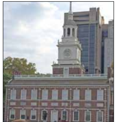
Independence Hall in Philadelphia.