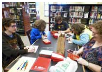
In November, members met at the Mint Hill Public Library to work on the Government Studies competition.

In November, we met at the Mint Hill Public Library to work on the Government Studies competition.