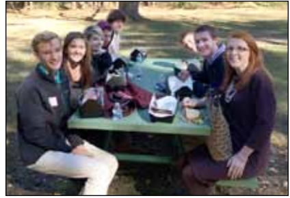
Members enjoyed a picnic lunch at Winter Board.