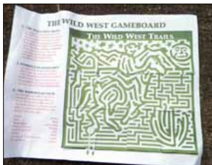
The Wild West puzzle gameboard.

activity as we enjoyed it tremendously last year.