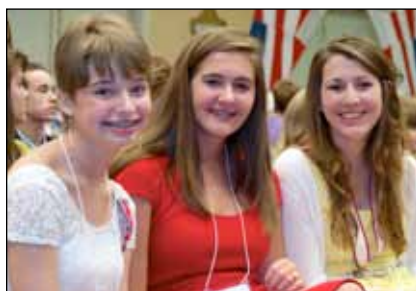
Members enjoying the business meeting at the Southeastern Regional meeting.