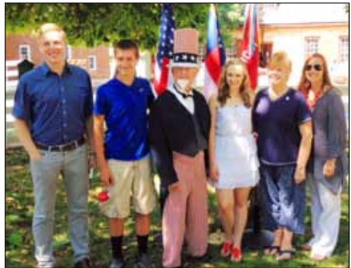
The Governor Alexander Martin Society attended and assisted in the Naturalization Ceremony in Old Salem on July 4.