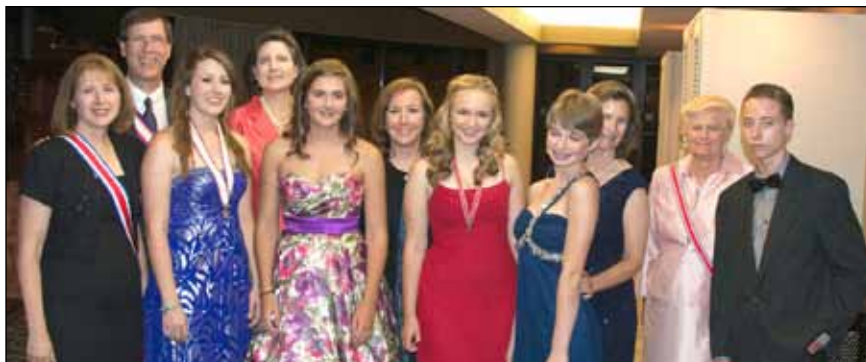
Seniors and members attended the Southeastern Regional meeting.