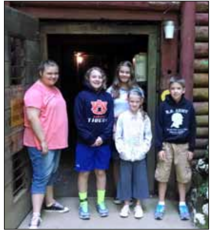
Members of the Rowan Resolves Society at the Reed Gold Mine.

The group watched a 30-minute video on the history of Reed's Gold Mine and toured the museum. Later we did a walking tour of the "potato patch" and underground mining tunnels, traveling approximately 400 feet and going approximately 50 feet under ground. For those of you not familiar with what the "potato patch" is, it was an area where people superficially dug in