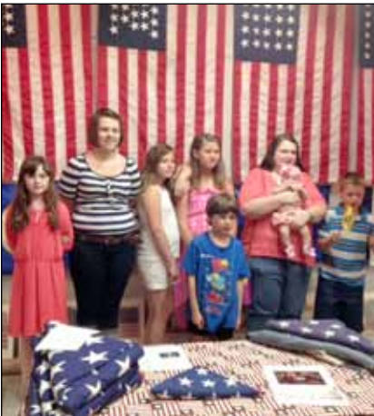
Members of the French Broad River Society met at the House of Flags in Columbus, NC.