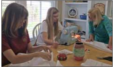
New Hanover Association Society members learn how to sew flags for use in area schools.