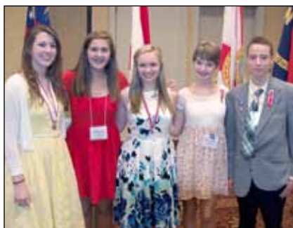
North Carolina Society members at the Southeastern Regional meeting.