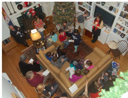
Joel Lane Society members meet on January 5