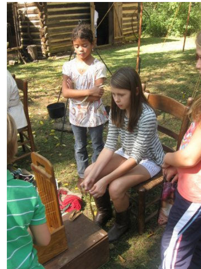
French Broad River Society members weave baskets