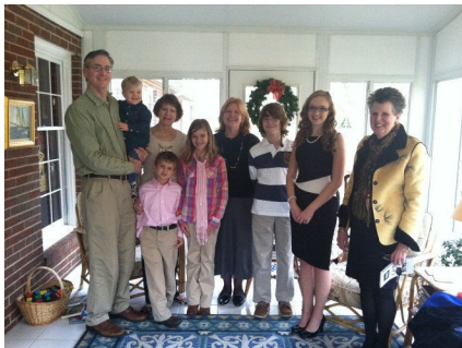
Gov. Alexander Martin Society members at their January meeting