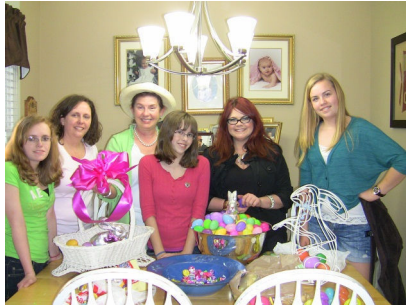
New Hannover Association C.A.R. and Wilmington Ladies Tea Walk DAR members filling Easter eggs for Constitution Display at Bank of America