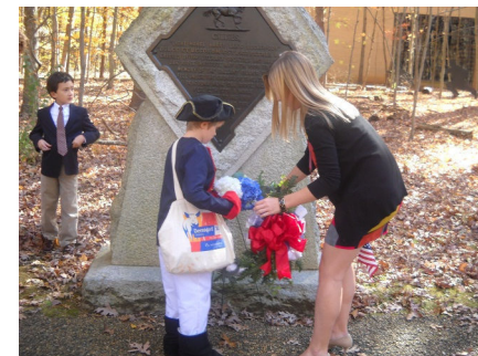
Members place a wreath at the Bugler Gillies Monument.