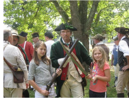
French Broad River Society members with a Hessian re-enactor

The French Broad River Society, Hendersonville, NC went to the Walnut Grove Plantation in Roebuck, NC near Spartanburg SC on October 6, 2012 for a reenactment of a Tory raid on the house.