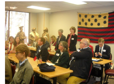
Winter Board meeting