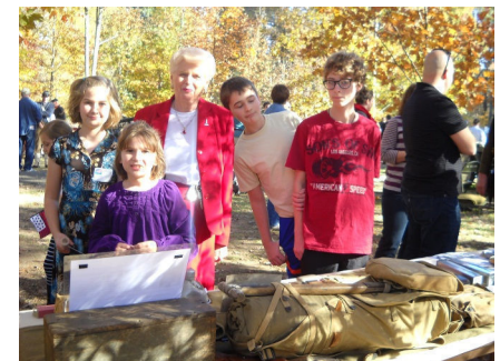
Members tour Guilford Courthouse Battlefield Park after Winter Board

Day program held outside at the military park across the street near the large statue of General Nathaniel Greene. The program on this sunny day included a couple dozen people dressed in period clothing of soldiers from the Revolutionary Period up through today. They had many uniforms and weapons displayed and they shared their extensive knowledge about the eras they represented. There were Vietnam Veterans there and the Korean War veteran had his purple heart which he earned when he was hit by a piece of shrapnel, as well as the uniform he was wearing when he was hit, a thick scrapbook from his service days, and enough interesting stories to fill the afternoon. It was an enlightening and enjoyable experience.