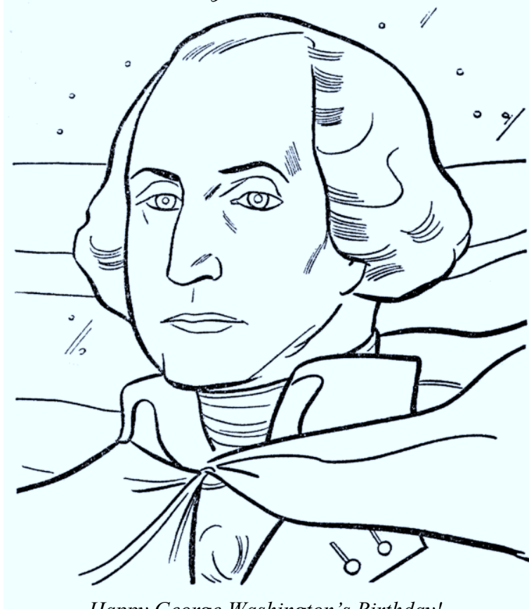
Happy George Washington's Birthday!