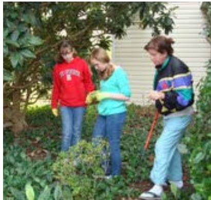
New Hannover Association members digging up kumquat tree seedlings. The girls assisted in potting and giving away 225 kumquat seedlings in honor of the 225th anniversary of the US