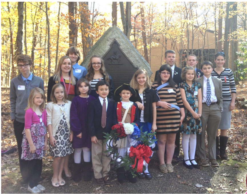
N.C.S.C.A.R. Members at Winter Board