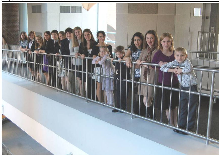
North Carolina members pose on the catwalk at the Sheraton in Downtown Raleigh