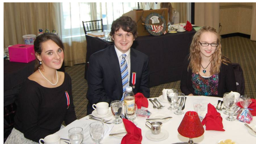
Members enjoy lunch at Winter Board