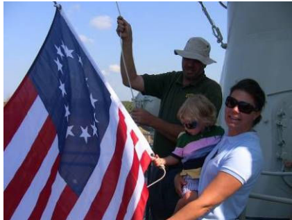
Society members raise the flag at the Battleship North Carolina. This flag is flown for the entire month of September in honor of Constitution Week.