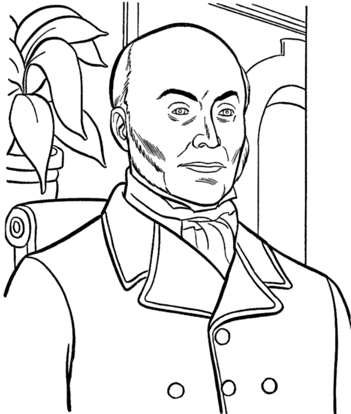
John Quincy Adams, 6th President, 1825-1829